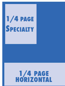
1/4 PAGE SPECIALTY

1/4 PAGE SPECIALTY 2 3 / 8 " W X 4 1 / 4 " H