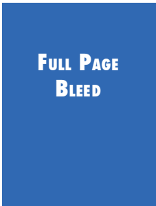
FULL PAGE BLEED